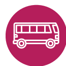
Memory Maker minibus